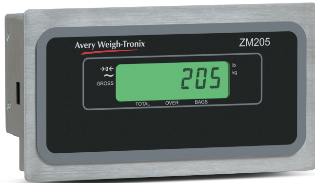
ZM205 Passenger Display