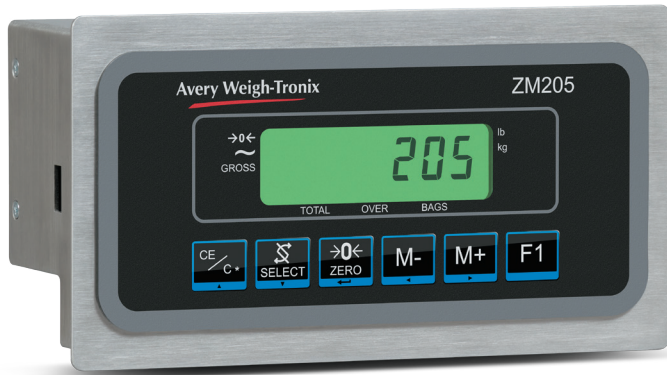
ZM205 Operator Display