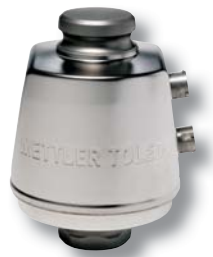
POWERCELL PDX Load Cell

Upgrade your scale to POWERCELL® PDX® technology and experience the ultimate in reliability. POWERCELL PDX load cells eliminate the need for maintenance-prone junction boxes, totalizers, and sectional controllers.