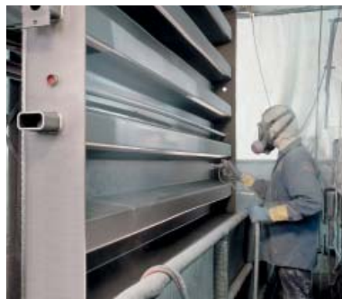
Metal surfaces are coated with a two-part epoxy finish to protect against corrosion.

The end result is a durable finish that protects against the corrosion and contaminants that can shorten the life of a scale.