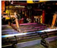
Modules are robotically welded