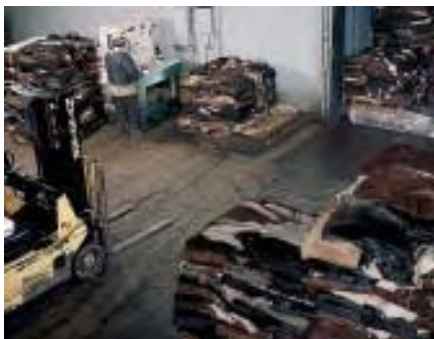
This stainless steel ProDec in a hide processing plant demonstrates its strength and reliability. The salt and chlorine used to cure hides are extremely corrosive, so nothing but a stainless steel ProDec will do.

ProDec's performance speaks for itself. The stainless steel ProDec has proven to be extremely reliable in environments that were even harsher than its designers imagined.